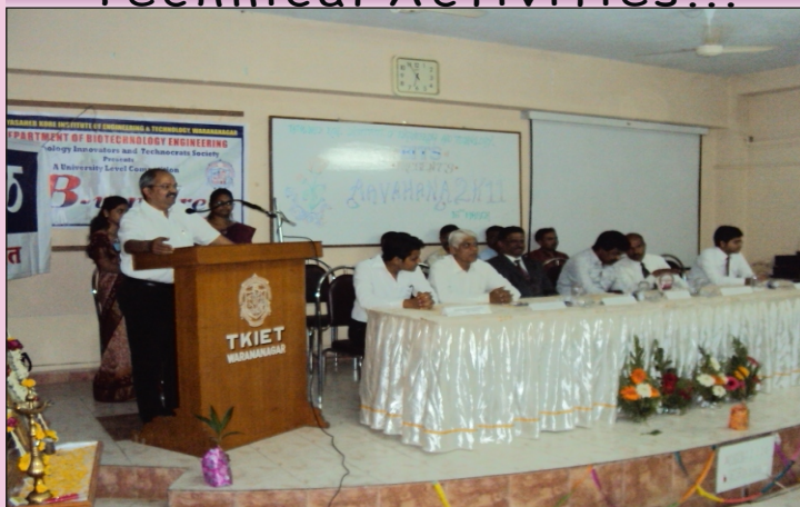
“B- Venture”, “Accentuate” and “Avahana”