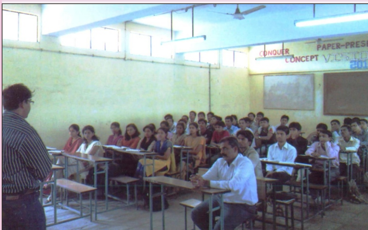
Guest Lecture on "The opportunities in public Sector"