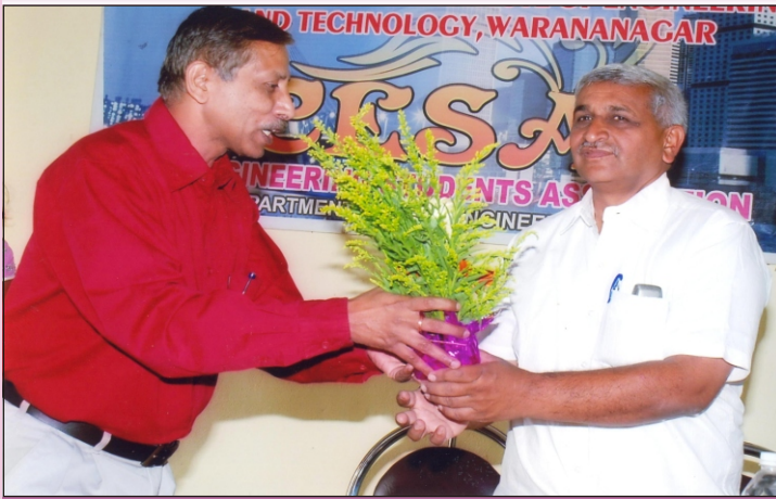
“Mile Stone 2k11” by CESA Committee