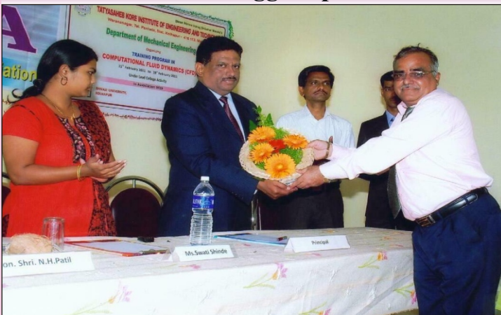
Faculty Training Programme on CFD