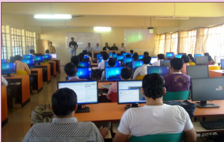
Workshop on PLC/SCAD