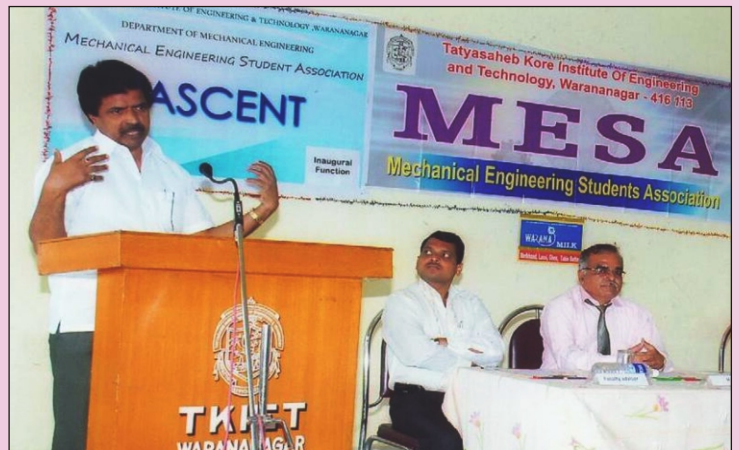
'ASCENT 2K11' by MESA