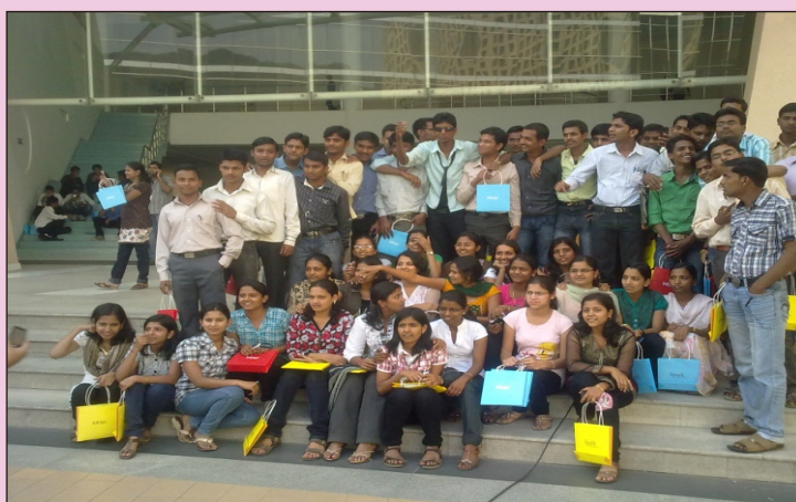
“SPARK” An Industrial Visit to Infosys