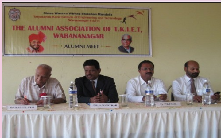
Alumni Meet for 2010-11