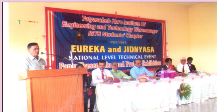
National Level Technical Symposium