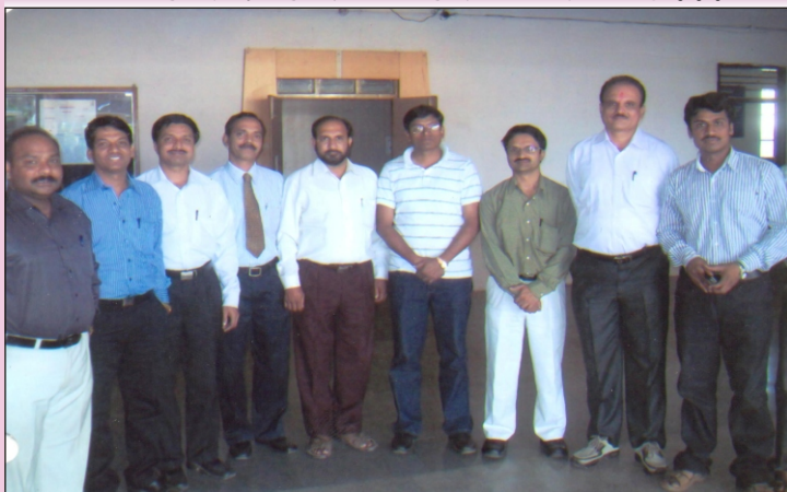
Workshop on 'Aspen Plus Software'