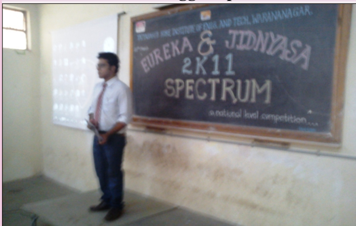
"Spectrum" by EESA Committee